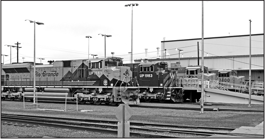
The Bailey Yard tour on September 16, 2011, included five of the six total Heritage diesel units on display at the shops in North Platte.

Bailey yard. I was pleasantly surprised to see that two other members of the Rocky Mountain Railroad Club, who had decided to see what “going east” would provide, were also on the bus. The Bailey Yard is 8-miles long and 2-miles wide. It is the largest railroad hump yard in the world, handling and servicing about 140 trains daily. During our 2-hour bus tour, we visited the east and west hump yards, the coal yard, the container and piggy-back yards, the repair facilities, the loco shops and all 350 miles of track in the complex. We enjoyed seeing a locomotive crane lifting a locomotive. We also enjoyed the car repair demonstrations. There were five of the six Heritage Diesel Units on display. I enjoyed each and every moment I was there.