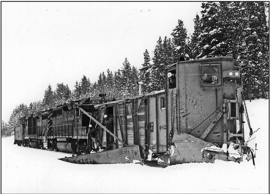
D&RGW spreader #042 and unit #3076 plowing westbound at west portal near Winter Park, Colorado on January 3, 1981.