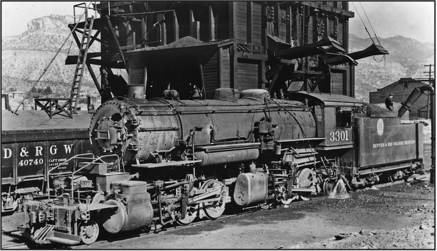
D&RGW #3301, a 2-6-6-2, is taking water at Helper, Utah, on an unknown date.