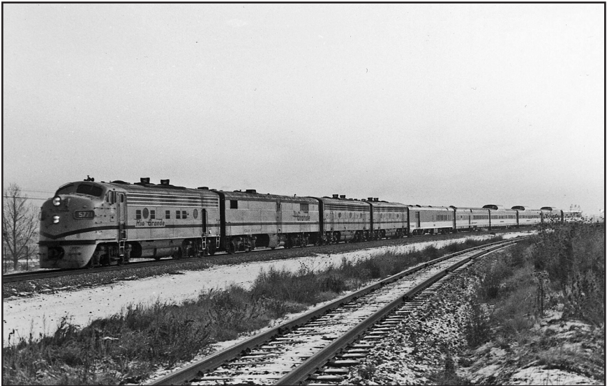
D&RGW #5771 is westbound at Tennyson Street in Arvada, with a destination of Salt Lake City on December 6, 1982.