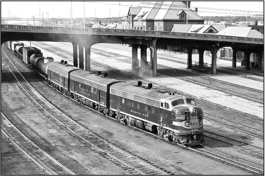
Eastbound manifest between Union Avenue and Main Street Bridges on the Loop Line.